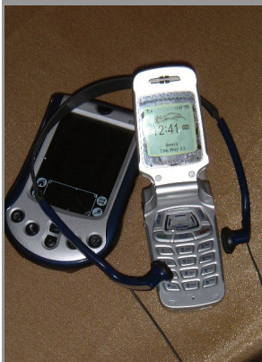
Communications Devices...Allowed or Not?