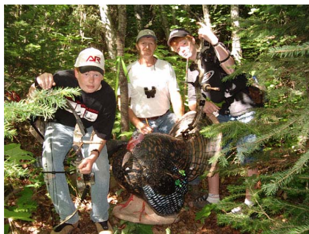
This Prize is a Real Turkey...