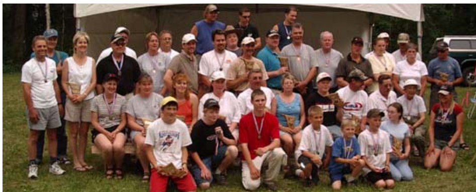
All the winners from June's BC 3-D Archery Championships.