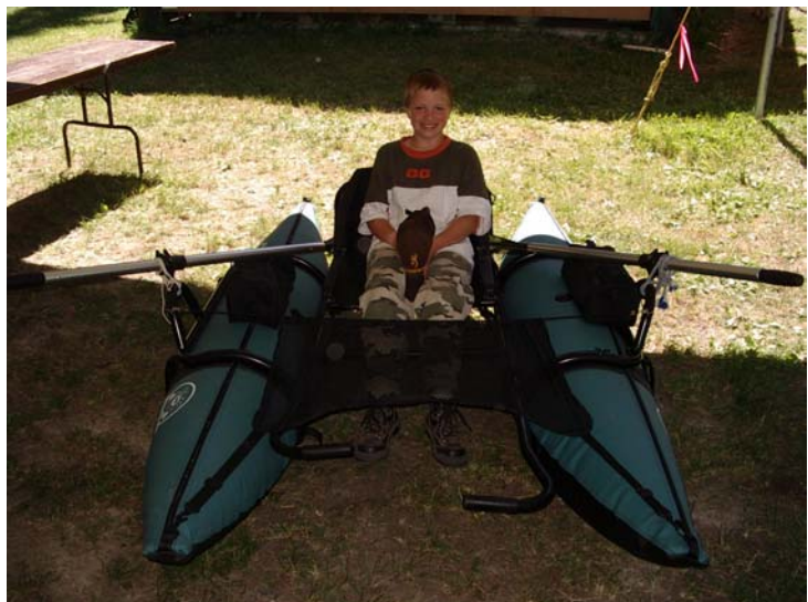
Twin pontoon boat - one of the great prizes at the competition...